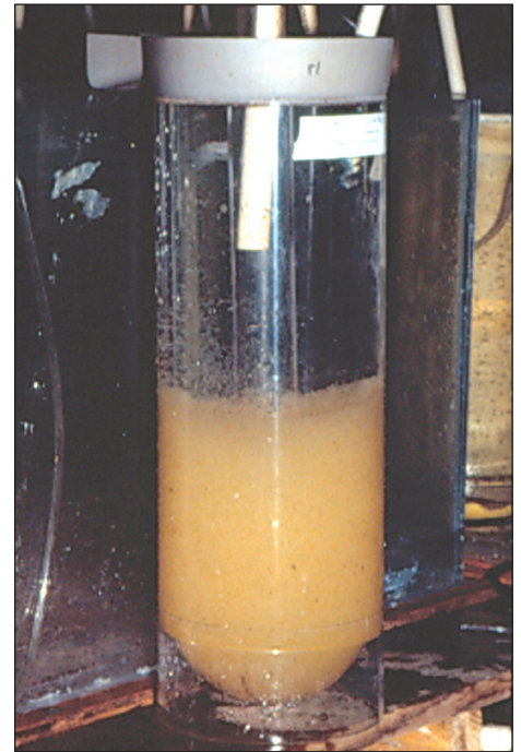
Figure 5. Incubating fertilized eggs in a hatching jar.

Fry are held in aquaria (30- to 75-gallon capacity) before pond stocking. Aquaria should have a 1-inch stand-pipe surrounded by a 300-micrometer mesh screen mounted on 6-inch pipe.