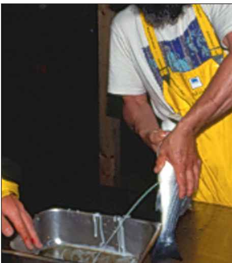
Figure 4. Manually stripping sperm from striped bass.

White bass eggs are adhesive and unless they are treated with a tannic acid solution successful incubation is