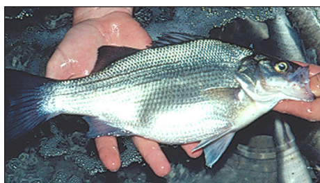
Figure 1. Mature white bass.

edge, North Carolina State University is the sole provider of domesticated white bass and striped bass to private industry at this time. Methods of holding domesticated broodfish are very site specific, and are just being initiated by private industry.