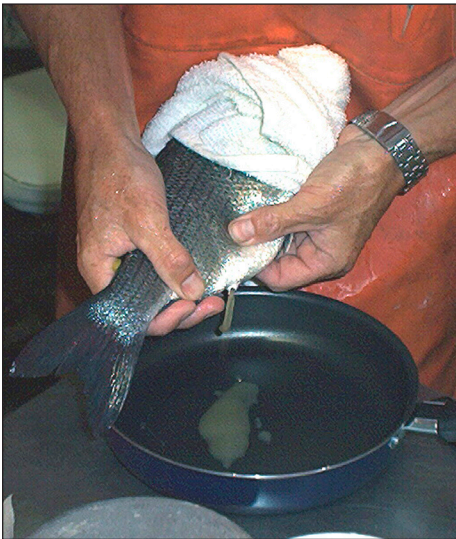
Figure 3. Manually stripping eggs from white bass into a Teflon-coated pan.

Teflon-coated pans are often used as spawning containers so eggs will not stick to the container. Eggs from several females may be stripped into the same pan before adding sperm. Water should be kept out of the container until after sperm has been added. Sperm from several males (Fig. 4) is mixed thoroughly with the eggs by stirring with a finger or feather. Water is then added to mobilize sperm. Eggs, water and sperm are gently mixed and fertilization is completed within 2 minutes.