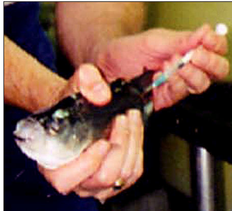
Figure 2. Injecting white bass with human chorionic gonadotropin (HCG) before spawning.

limited to the production of sunshine bass. Human chorionic gonadotropin (HCG) hormone is used to induce final maturation and ovulation of eggs of white bass, and to enhance sperm production of striped bass. Females and males should be anesthetized with MS-222, quinaldine or clove oil to reduce stress whenever they are handled. The hormone is injected intramuscularly below the dorsal fin and above the lateral line (Fig. 2).